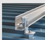
Corrosion around fixtures and fittings*