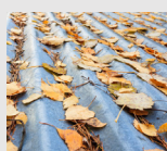
Leaves and Pollen