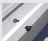
Fasteners & washers showing signs of corrosion

Every 6-12 months you must check roofing for: