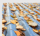
Leaves and Pollen